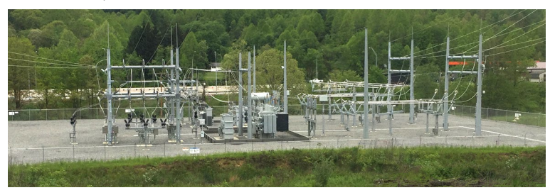
*Substation shown is a general depiction of the proposed substations that will be built for this project. It does not represent final design.

Substations serve as electrical intersections converting the power to lower voltages so it can be distributed onto distribution lines that deliver electricity to where we live and work. Substations step down the voltage to levels for use in homes, businesses and industrial facilities.